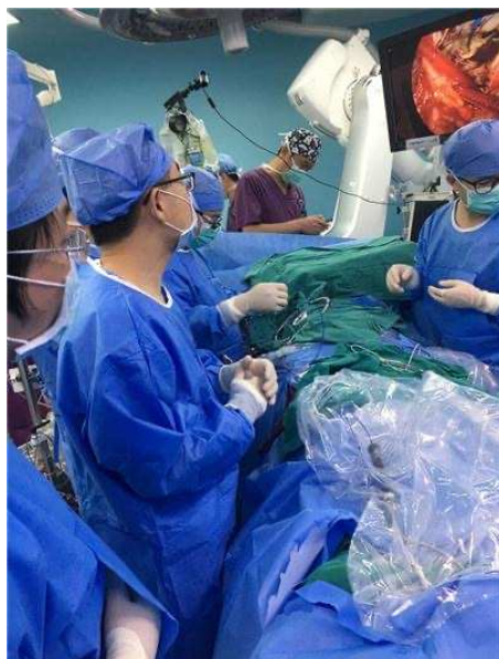
Figure 3. Cardiac surgery.

After radiofrequency ablation of atrial flutter, the surgical nurse provided the valve forming suture line to cooperate with tricuspid valve forming. The nurse is responsible for the preparation of ring detectors and artificial rings before surgery. Before opening the artificial valve ring of high-value consumables, the surgeon, instrument nurse and circuit nurse shall jointly check the model, brand and validity period. 36-37°C normal saline 1000ml-1500ml was prepared to test the tricuspid valve forming effect after completion of the forming operation (Figure 3).