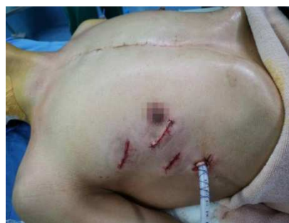
Figure 2. Puncture of the right femoral vein.

Conventional drugs for extracorporeal circulation, rescue drugs (epinephrine, deoxyepinephrine, magnesium sulfate, calcium gluconate, lidocaine, sodium bicarbonate, potassium chloride) and cardiac arrest fluid. (2) Heparin sodium, the dosage of which is 1:1 based on body weight, is different from the conventional body circulation dosage; Heparin, it is based on body weight 1:3.5 (Figure 2). (3) Protamine neutralizes heparin sodium, and its dosage should be 1.5:1; (4) electrophysiological mapping was used to induce ventricular fibrillation (0.25mg isoproterenol plus 250ml normal saline).